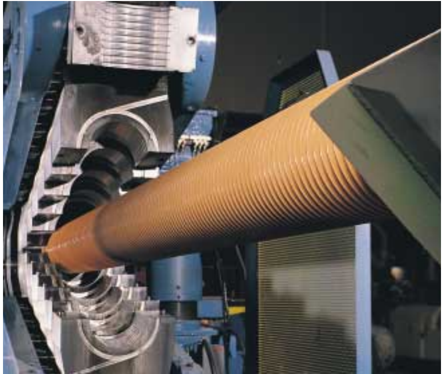
Osma UltraRib pipe production

All products carry the Wavin assurance of quality and reliability.