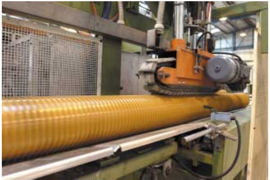
Osma UltraRib during manufacture