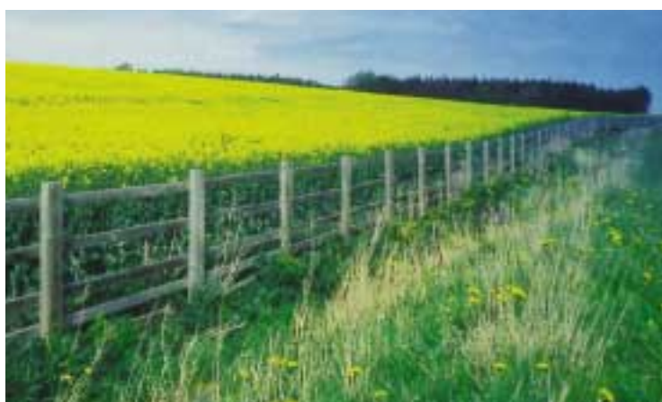
WavinCoil provides cost effective land drainage